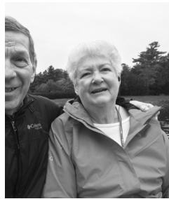
JEANNE & HUNT DAVIS Graduate Research Award