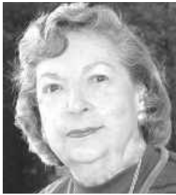
MADELYN M. LOCKHART Graduate Research Award